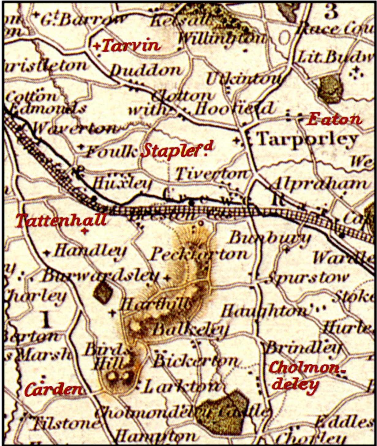
Western Cheshire County, England, 1836 (Tattenhall to Tarvin = 5 miles)